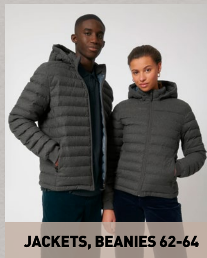
JACKETS, BEANIES 62-64