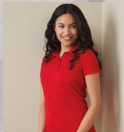
POLO SHIRTS 24-33